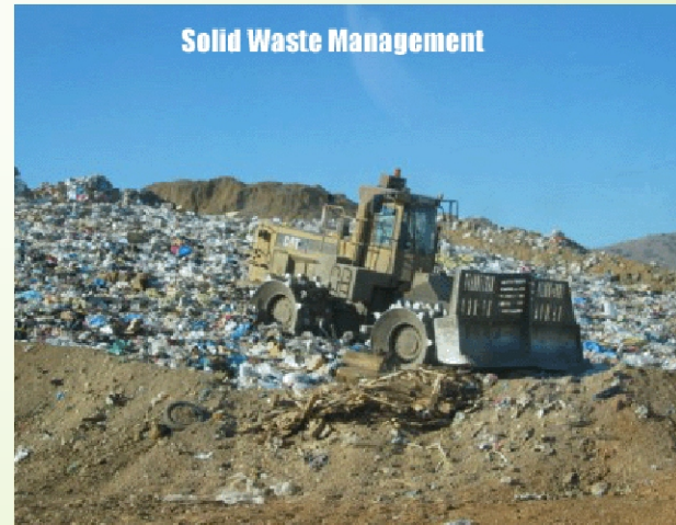
Solid Waste Management